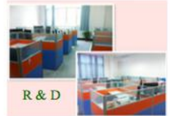
R & D