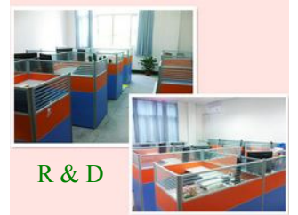
R & D