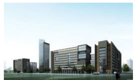
Industrial park over view, Factory buildings, Office building, Dormitory buildings