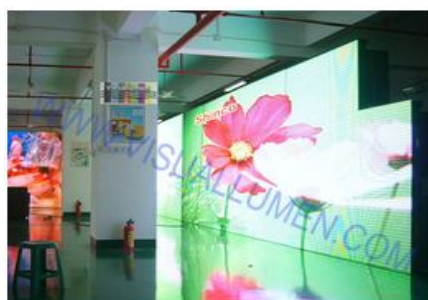
LED display ageing