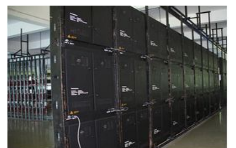
LED display ageing